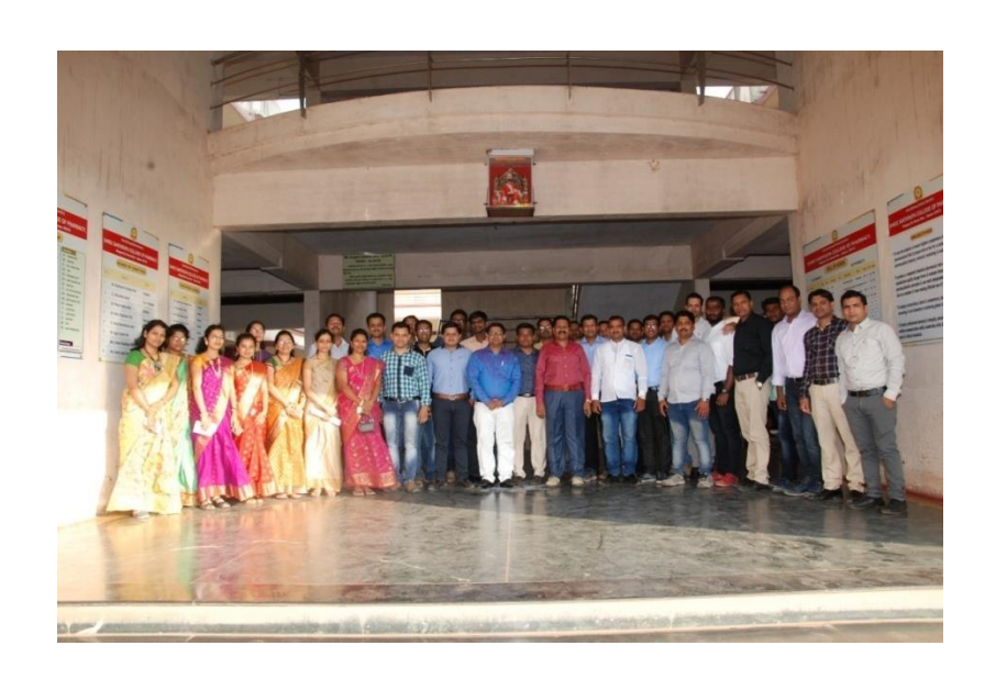
Alumni Meet - 2018